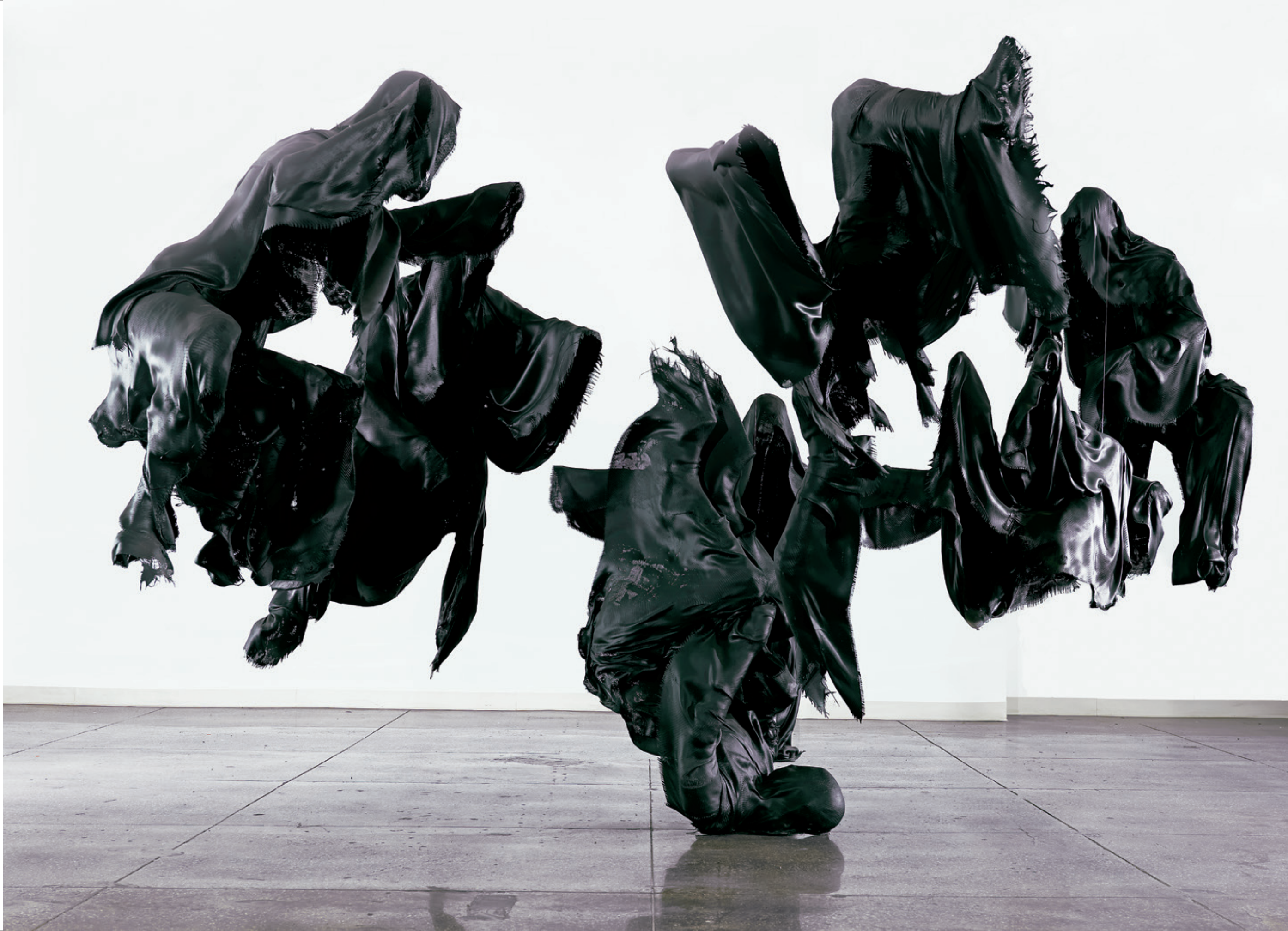
Plate 1 Robert Morris Out of the Past , 2016 Carbon fiber and epoxy 88 x 138 x 184 inches (overall)