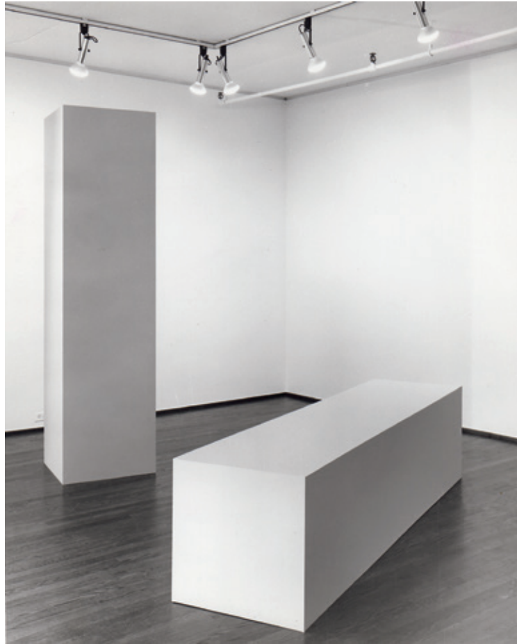
Figure 5 Robert Morris Two Columns , 1961 Painted aluminum (fabricated 1973) Two units, each 96 x 24 x 24 inches

The circumstances of Column's creation reinforce the symbolically charged quality of its seemingly neutral form. Living in California