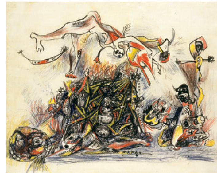
Figure 4 Jackson Pollock War , 1947 Pen and ink, and colored pencils on paper 20 ¾ x 26 inches The Metropolitan Museum of Art Gift of Lee Krasner Pollock, in memory of Jackson Pollock, 1982

abstract figures that occasionally emerge from Pollock’s web, and Criss-Cross is not an abstract visual field but a shambles. However this visceral scene may not be so foreign from the latent imagery of Abstract Expressionism. Pollock’s 1947 drawing War [Figure 4] similarly depicts a field heaped with bodies, with a crucified figure standing sentinel at right.