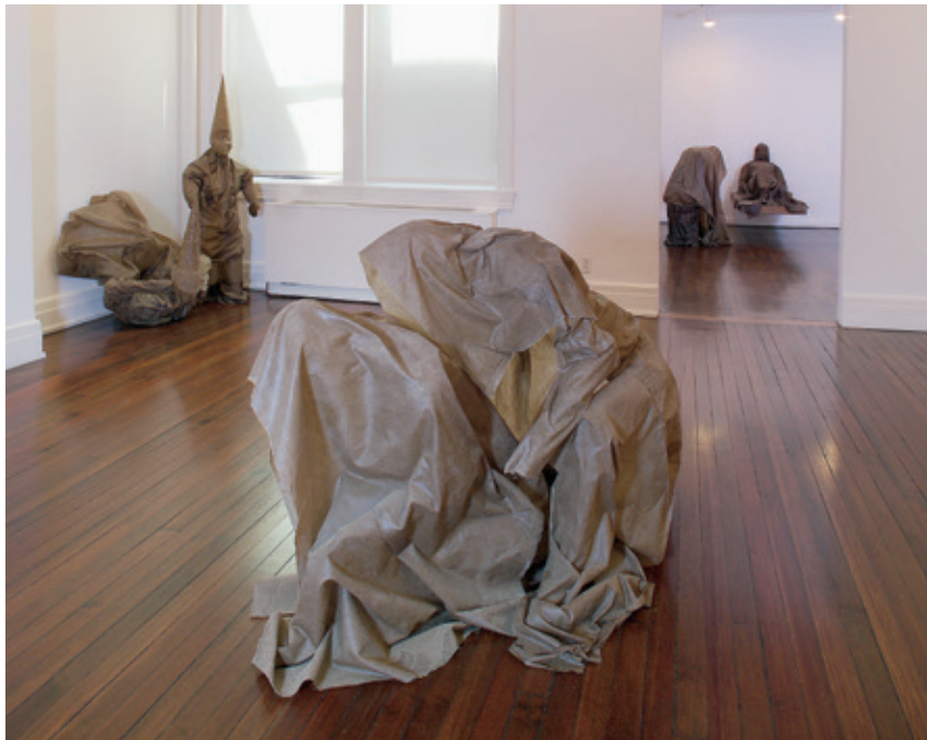
Figure 1 ROBERT MORRIS MOLTINGSEXOSKELETONSSHROUDS September 12 – November 14, 2015 Castelli Gallery, installation view

Viewers familiar only with Morris' Minimal sculptures may be surprised—even shocked—by his new work. His “unitary forms” of the 1960s deliberately avoided the compositional complexity of traditional sculpture and painting. Instead of creating “internal” relationships, Morris wrote in 1966, the Minimal object “takes relationships out of the work and makes them a function of space, light, and the viewer's field of vision.” His simple geometric constructions seemed to refuse any connection with traditional sculpture.