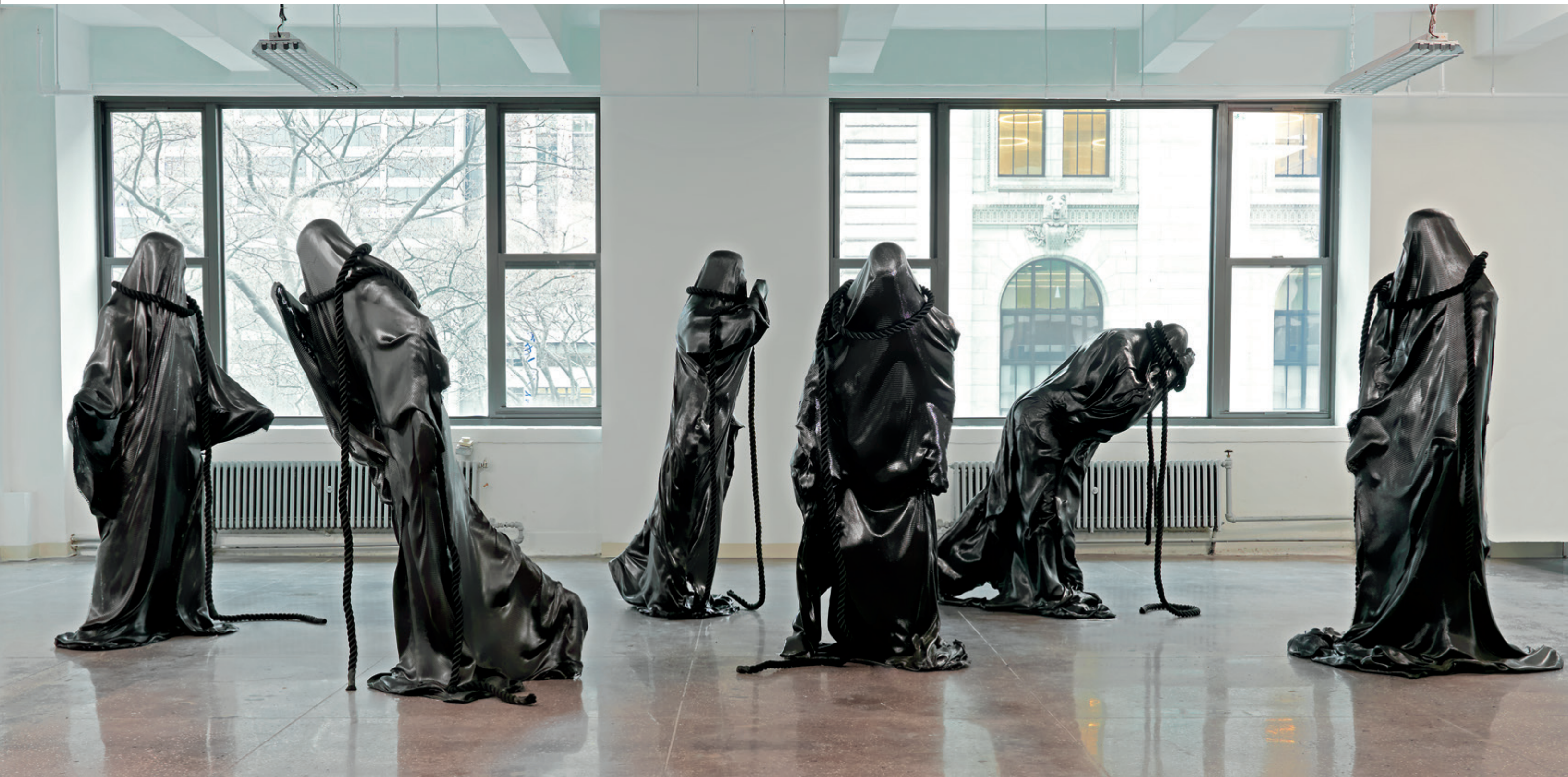
Plate 4 Robert Morris Dark Passage , 2017 Carbon fiber and epoxy 72 x 230 x 120 inches (overall)