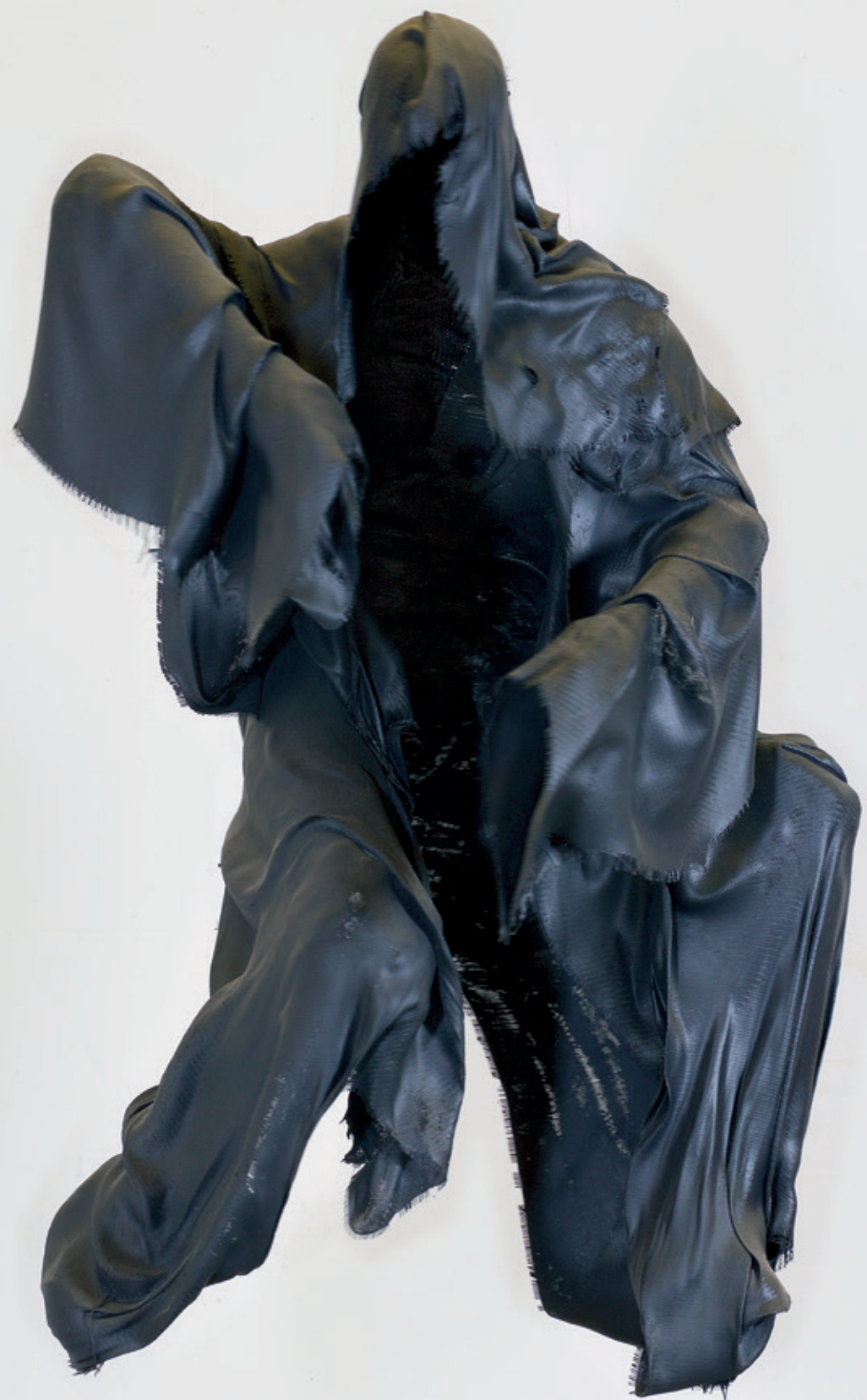
Robert Morris Out of the Past , 2016 (detail, see Plate 1)