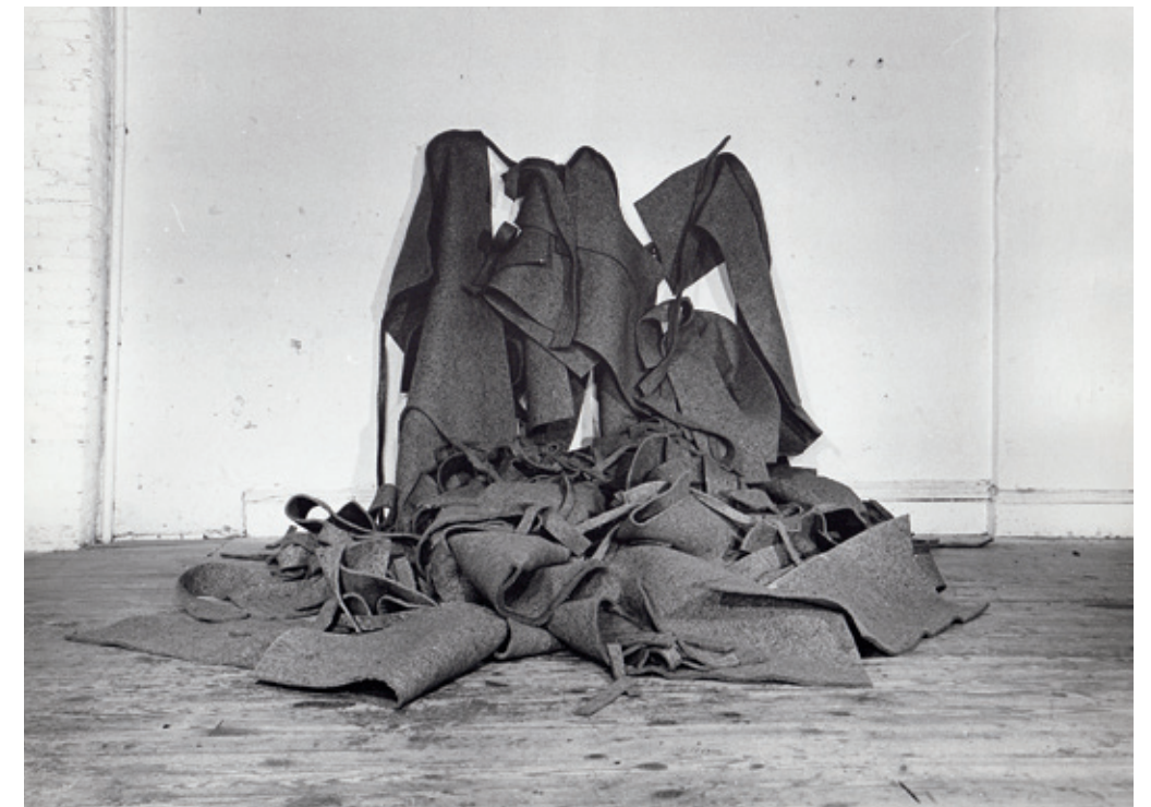
Figure 8 Robert Morris Untitled , 1967 Gray felt Indeterminate dimensions San Francisco Museum of Modern Art Phyllis C. Wattis Fund for Major Accessions

The draperies of the Boustrophedons look back to the felt works that Morris began making in 1967 [Figure 8]. In these, he began with large pieces of industrial felt, cut them into geometric swatches and patterns, and suspended them from the wall or simply piled them on the floor. The original geometric pattern vanished or was gorgeously distorted by the interaction between the force of the gravity and the weight and stiffness of the felt. From Ancient Greece through the Baroque era, tailors and artists had created an expressive language of drapery. Morris detached this language from the human body.