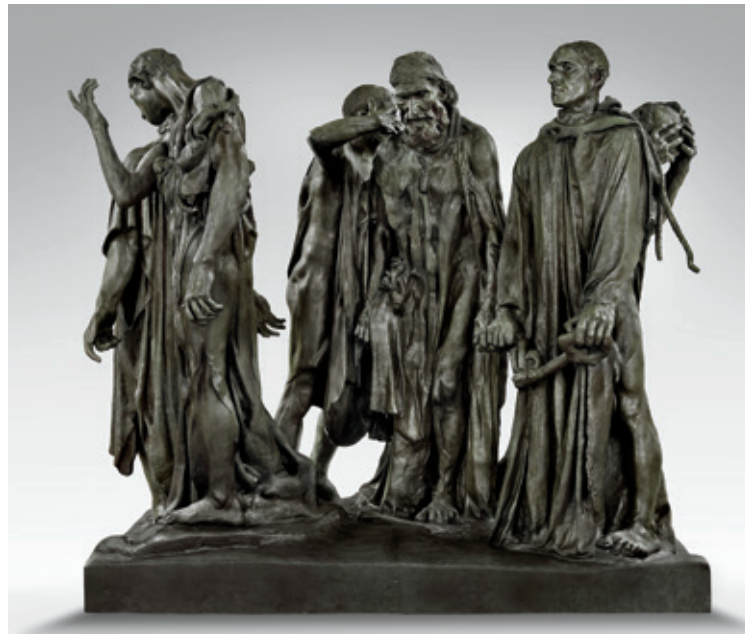
Figure 3 Auguste Rodin The Burghers of Calais Modeled 1884-95; cast 1919-21 Bronze 82 ½ x 94 x 75 inches Philadelphia Museum of Art Bequest of Jules E. Mastbaum, 1929

Personal disquiet and political disgust also pervade the imagery of the three other installations in Boustophedons . Dark Passage [Plate 4] depicts a group of prisoners advancing toward their execution. Morris’ figures evoke Auguste Rodin’s The Burghers of Calais [Figure 3], commissioned in 1884 by the city of Calais to record a dramatic episode of the Hundred Years War. After the troops of the English King Edward III encircled Calais, he offered to lift the siege if six leading citizens would serve as sacrificial victims on their city’s behalf. Six wealthy burghers volunteered, emerging from the city gates with nooses around their necks to acknowledge their impending death. However, the proud and stoic bearing of the men persuaded the English to spare their lives. The citizens of nineteenth-century Calais, expecting Rodin to render the heroism of the burghers, were outraged by his sculpture, which seemed to show the burghers trembling with fear. Morris’ rendering veils the men’s facial expressions, but their stooped postures betray their terror. Morris’ drapery here recalls not so much the narrow, vertical folds of Rodin’s