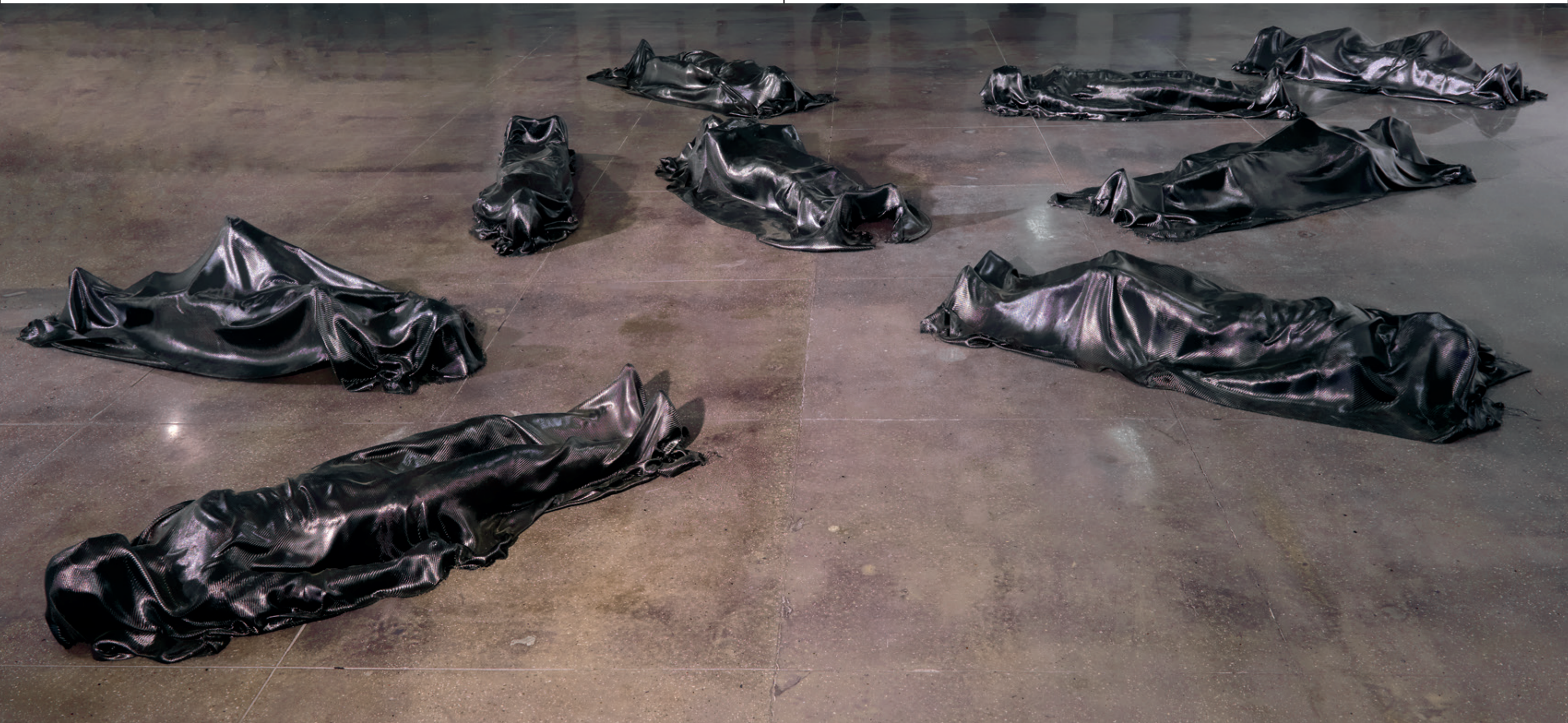
Plate 2 Robert Morris The Big Sleep , 2016 Carbon fiber and epoxy Nine units, each approximately 15 x 35 x 80 inches; disposition variable