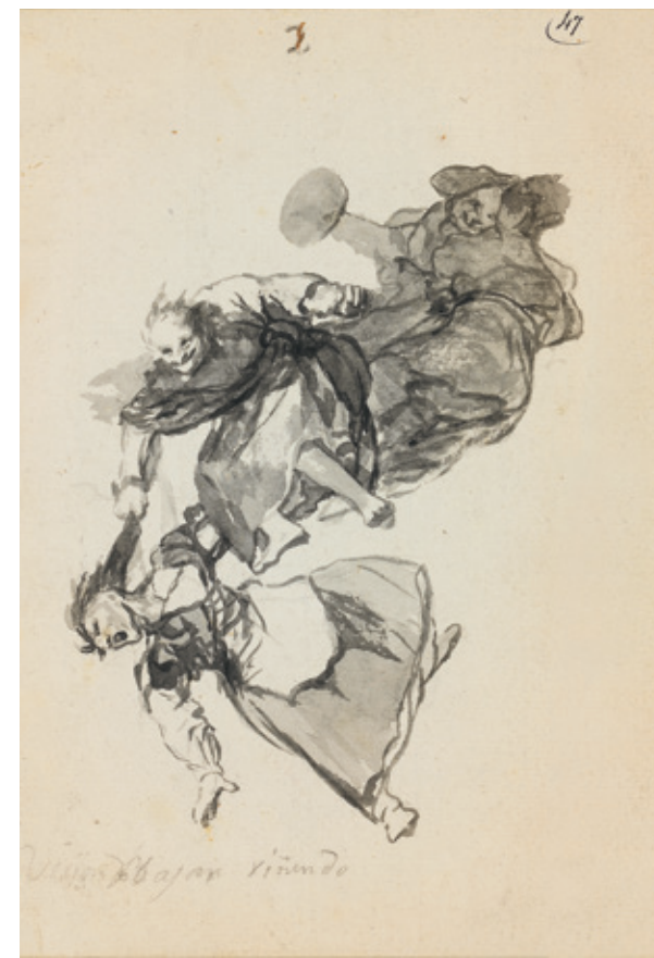
Figure 2 Francisco Jose de Goya y Lucientes They Go Down Quarreling Brush and grey wash on paper 9 ¼ x 5 ½ inches Private collection

Morris' new work, however, refers constantly to art history. His 2015 installation MOLTINGSEXOSKELETONSSHROUDS [Figure 1] included two figures wearing tall pointy hats (like “dunce caps”), recalling the pathetic victims in Francisco Goya's pictures of the Spanish Inquisition. The