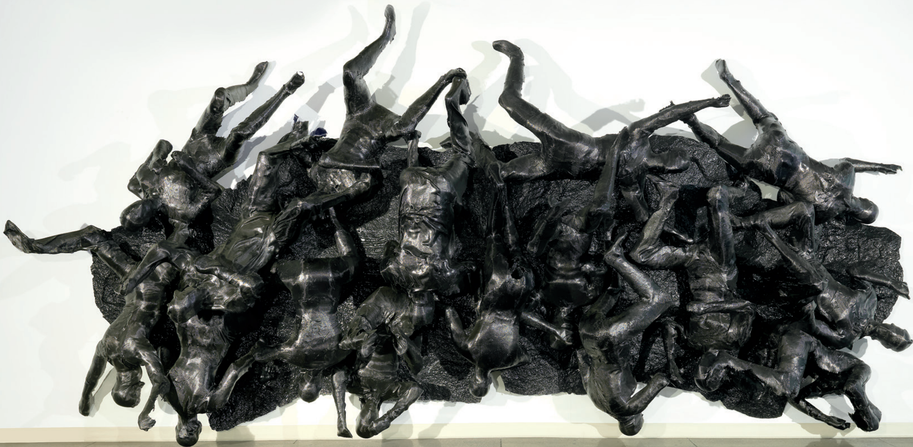
Plate 3 Robert Morris Criss-Cross , 2016 Carbon fiber and epoxy 120 x 229 x 48 inches